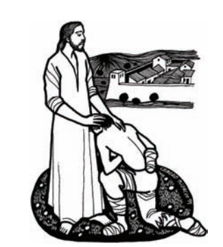
Repent and Believe in the Gospel